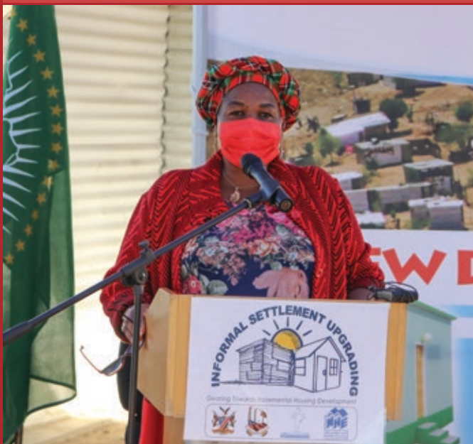
Hon. Laura McLeod-Katjirua , Governor of Khomas Region delivering Welcoming Remarks during the handover of 131 houses that were constructed under the Informal Settlement Upgrading Pilot Project in Okuryangava, Onyika No.2.

In an effort to address the housing shortage in the Region, the Khomas Regional Council and other stakeholders saw a handover of a total of 131 houses that were constructed under the Informal Settlement Upgrading Pilot project in Okuryangava, Onyika No.2. This project is a joint initiative of the Ministry of Urban and Rural Development, Khomas Regional Council, City of Windhoek and National Housing Enterprise (NHE) which was launched in July 2020 with the aim to construct affordable and decent houses for residents in the informal settlement in order to address the housing provision challenge.