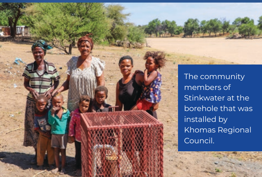
The community members of Stinkwater at the borehole that was installed by Khomas Regional Council.

The Regional Council allocated a total budget of N$1.7 Million for drilling and installing boreholes.