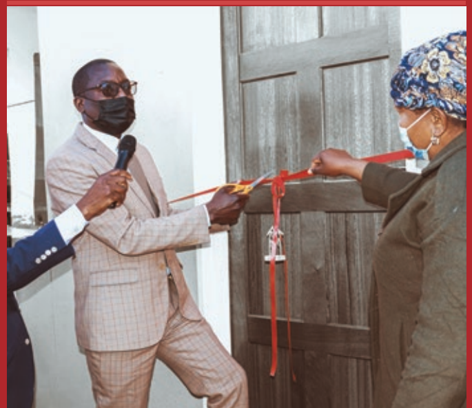
Hon Erastus Uutoni , Minister of Urban and Rural Development cutting the ribbon during the handover of 131 houses that were constructed under the Informal Settlement Upgrading Pilot project in Okuryangava, Onyika No.2.