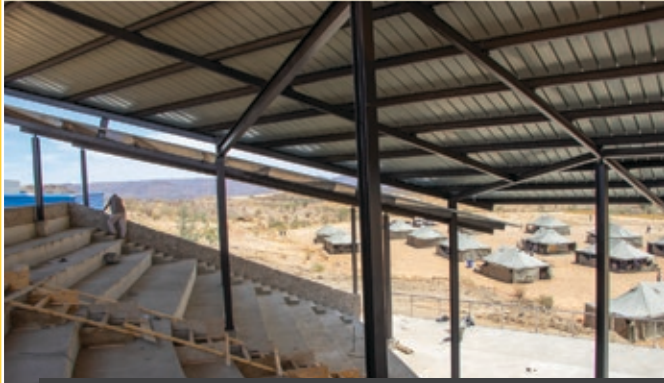
Amphitheatre at Havana Project School