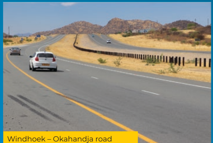
Windhoek – Okahandja road