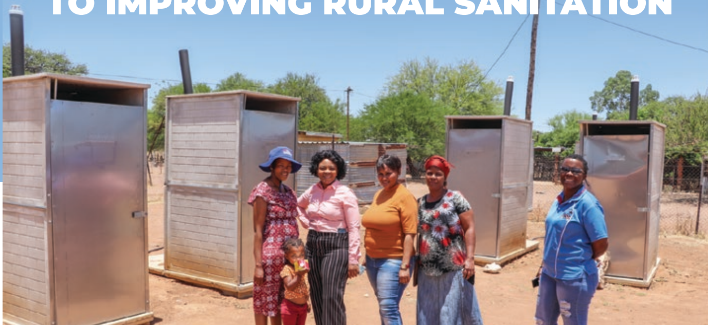
Community toilets in Dordabis.

T he Khomas Regional Council supports various projects and programmes within the Windhoek Rural Constituency. The Council has various programmes such as Rural Sanitation, Regional Specific Action Plan/Food security, Cash/Food for Work Programme, Micro Finance, Rural Employment Scheme, One Region One Initiative and Support to Poor Farmers. Rural Development programmes are tailored to benefit the most vulnerable communities, unemployed youths, SMEs, elderly and previously disadvantaged groups. The projects and programmes aim to improve rural sanitation, create employment, promote sustainable use of natural resources, promote entrepreneurship development in rural areas and reduce poverty.