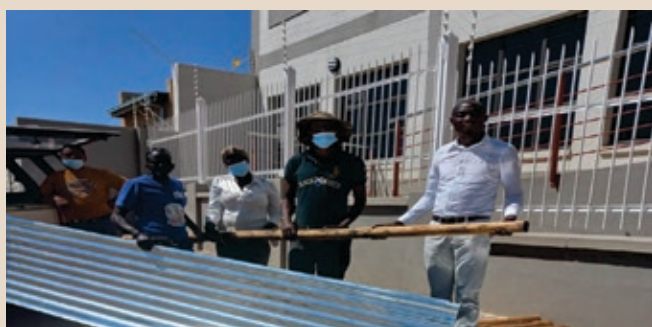
Handover of building materials to fire victims whose shacks burned down in Khomasdal Constituency.