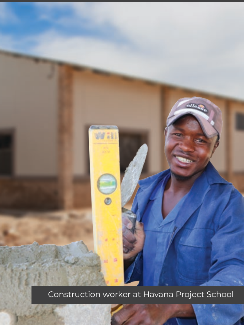
Construction worker at Havana Project School

The Khomas Regional Council continues to strive for improvement in terms of access to education, quality of education, and efficiency and effectiveness in education.