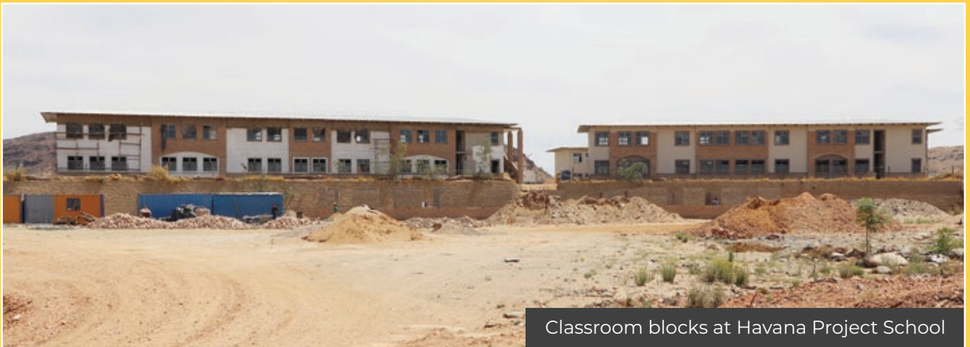
Classroom blocks at Havana Project School