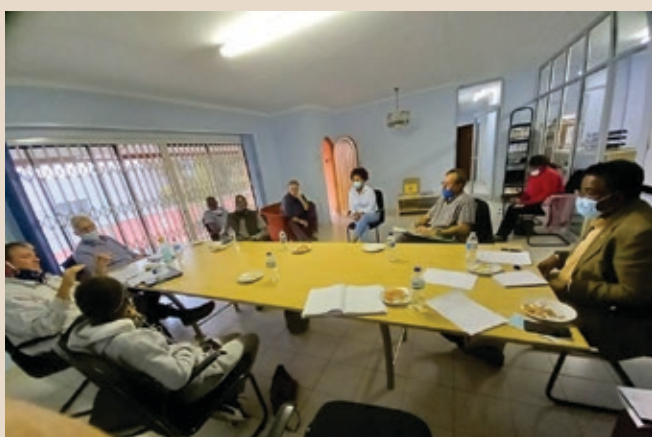
Windhoek East Constituency Community Development Committee (CDC) Meeting in session.