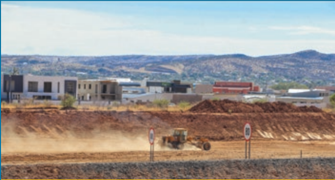
Ongoing construction of Windhoek – Hosea Kutako International Airport (WHK-HKIA) .

Here is a look at the road infrastructure in Khomas Region: