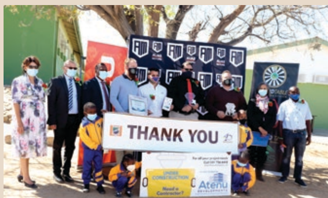
Inauguration of a classroom at Bet-el Primary School in Katutura East Constituency.