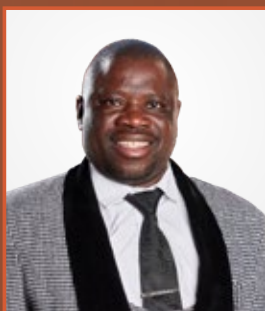
Hon. Christopher Likuwa, MP Councillor: Tobias Hainyeko Constituency