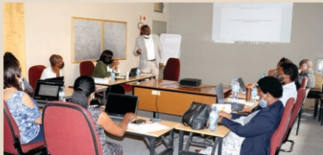
Khomas Regional Council hosted Senior Managers from Erongo Regional Council for the purpose of benchmarking.