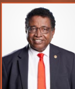
Hon. Brian Kephass Black Councillor: Windhoek East Constituency