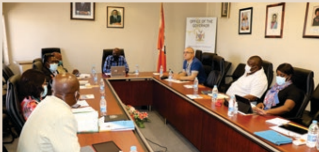
Chief Regional Officers (CROs) Forum discussing issues that affect the regional councils during a meeting at the Khomas Regional Council.