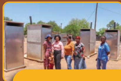
Community toilets in Dordabis constructed by Khomas Regional Council. Page 10