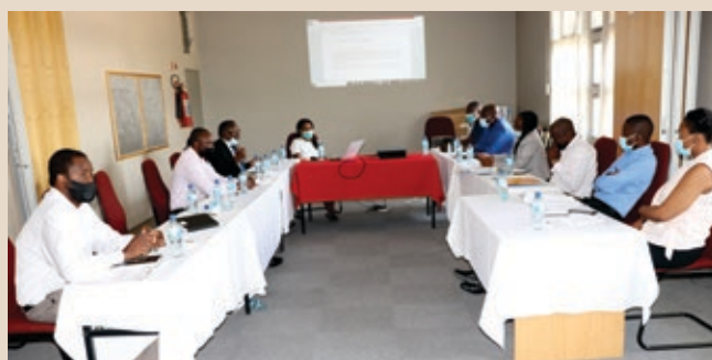
Khomas Regional Council hosted Senior Managers from Omusati Regional Council for the purpose of benchmarking.