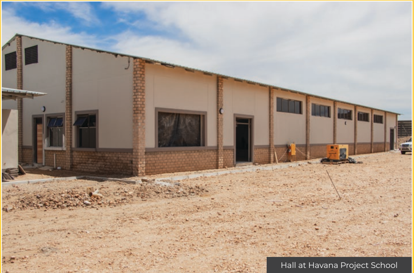
Hall at Havana Project School