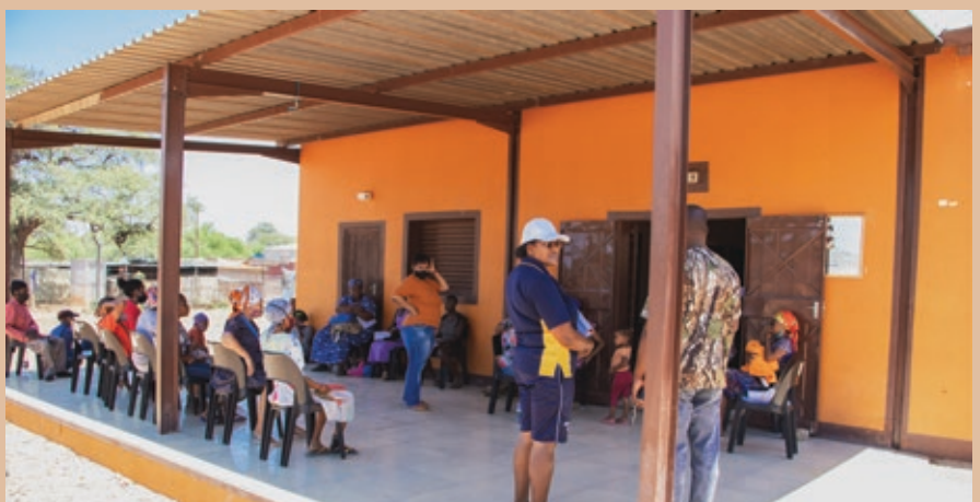
Community members gathered outside the Hall for Covid-19 vaccination.