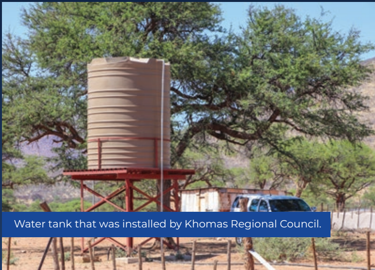
Water tank that was installed by Khomas Regional Council.

Kransneus, Hatsamas Post A and Hondingaan. In addition, installation was also carried out at an existing borehole at Hatsamas Post B.