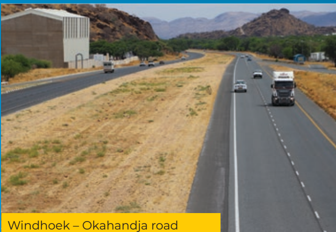
Windhoek – Okahandja road